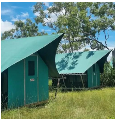
Permanentes Safari Camp

Unterkunft: Permanentes Safari Camp oder Basic Swag