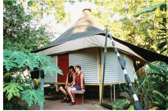
Bush Bungalow, Kakadu