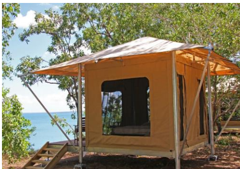
Cobourg Coastal Camp (permanent safari tent)

Arrive into Darwin at approximately 7:00pm.